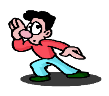
4. Can you speak louder?