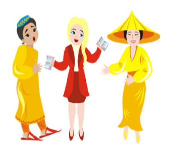
5 Translate it into English or Say it in English