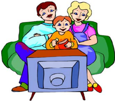
1 Watching television is a pleasant way for families to spend time together.