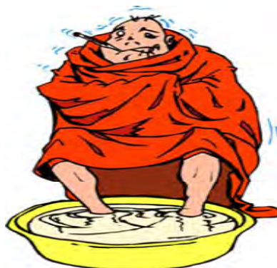
11 I felt ill because .....