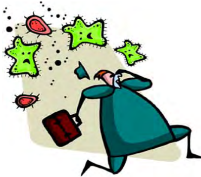
8 I protect myself against bacteria by.....