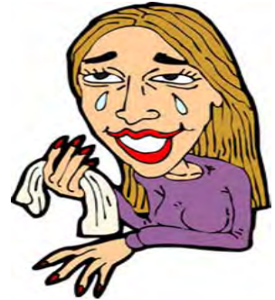
3 Tears roll down my face when.....