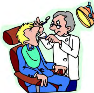
5 I have cavities in my teeth because.....