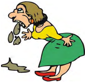
1 I vomit when I .....

Complete the sentences under the pictures.