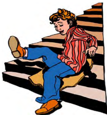
7 I had a bad fall because .....