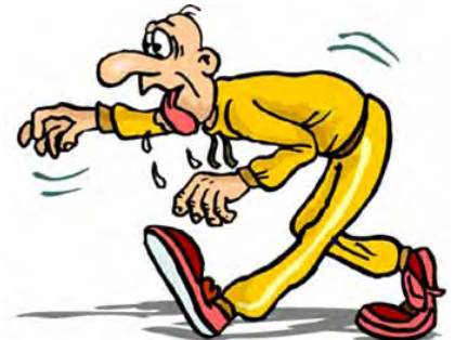
9 Dehydration is a problem when .....