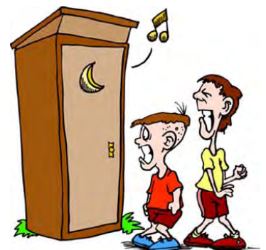
12 I got diarrhea when .....