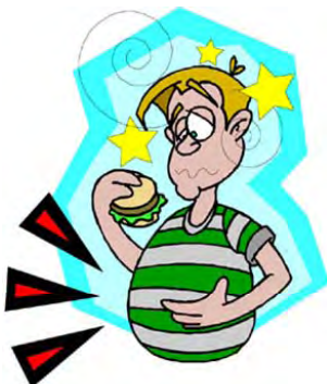
10 I have stomach pain because .....