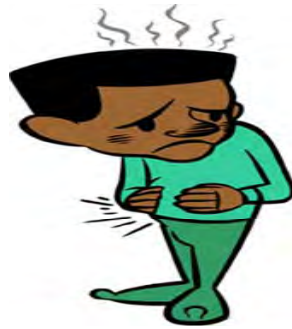
2 When I have a fever .....