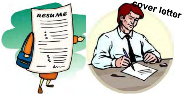
1 Write a resume and cover letter

Write sentences under each picture describing each step of the process.