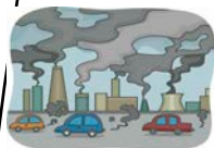
air pollution is leading to health problems