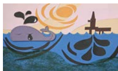
Oil spills are killing whales