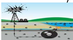
fracking is destroying water supplies

3. After there are sufficient places on the map it is passed to the next group of students. These students proceed to write as many environmental problems as they can on the map.