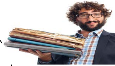
I am conscientious. I do a lot of research.