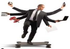
10 _____ _____