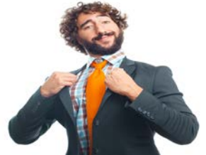
3 _____ _____