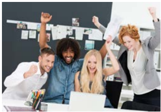
11 _____ _____