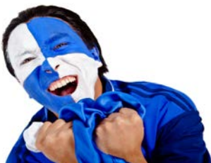
8 _____ _____