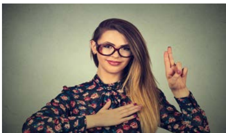
9 _____ _____