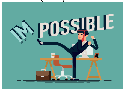
7 _____ _____