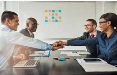
12 _____ _____