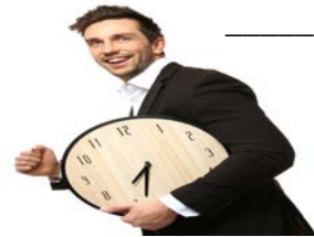
4 _____ _____