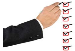
2 _____ _____