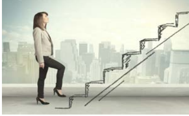
13 _____ _____