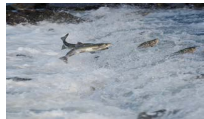
5 _____ _____