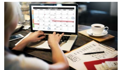
6 _____ _____