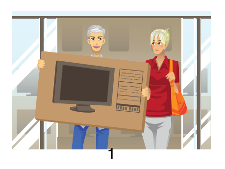
He has just bought a flat screen TV.