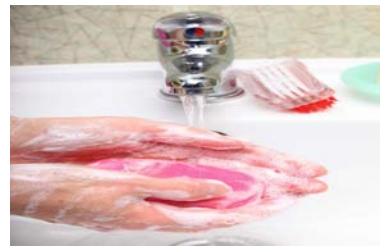
1 Washing your hands prevents disease