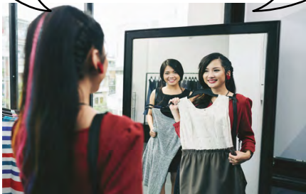
1 choosing a dress