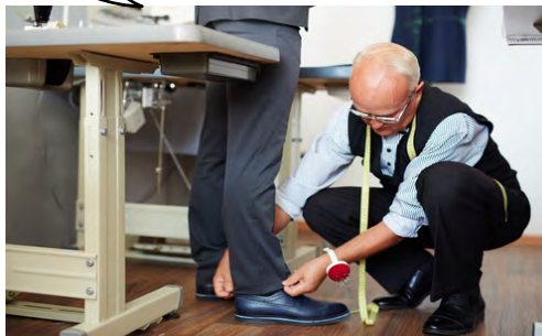
4 measuring long pants/trousers

Yes, not too long .. not too short.....perfect.