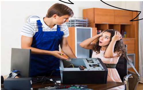
5 ___ getting a computer repaired