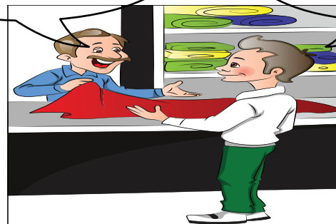
6 choosing some material