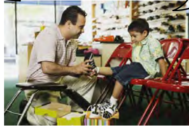
2 ___ buying shoes