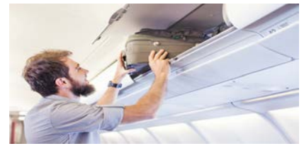
1 He puts the bag up in the overhead compartment