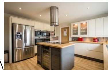
1 I can cook anything I want in a modern kitchen .