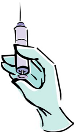
7 Some people wear _____ to protect themselves against _____