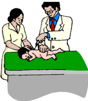
4 The baby is getting a _____ to give it _____.