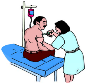
1 He is getting an _____.

injected biohazard insulin needle shot addiction draw gloves infection reuse injection syringe dose immunization