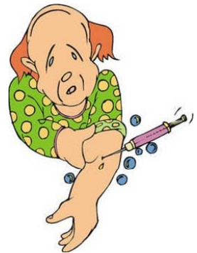
6 Drug _____ is a problem in our society.