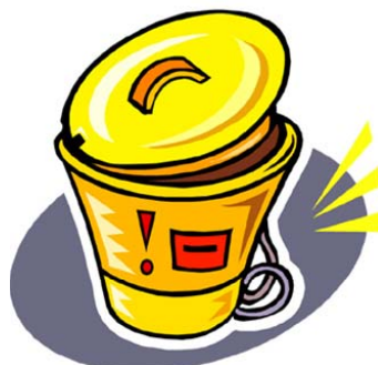
8 Syringes may be a _____