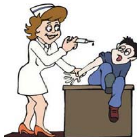
2 She is using a _____ to _____ blood