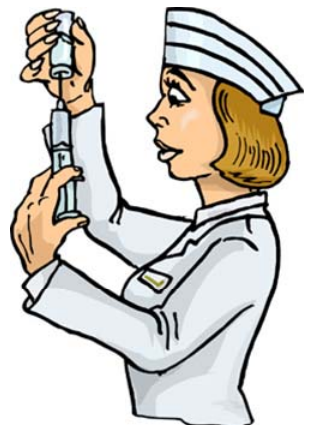
9 The nurse is making sure she is using the correct _____