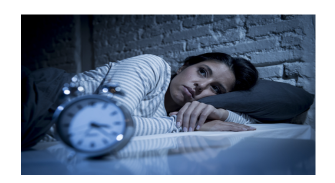
insomnia Causes / Effects