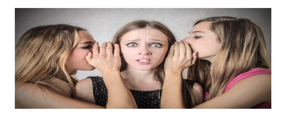
Classification of types of gossip