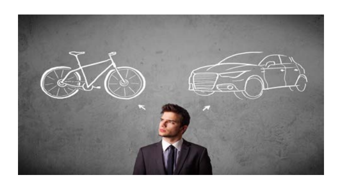
bicycles vs cars Comparison Similarities / Differences