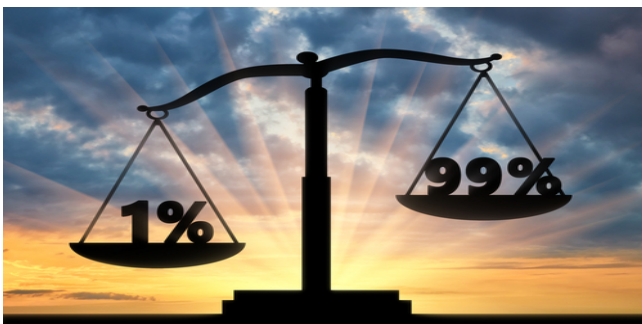
inequality Causes / Effects