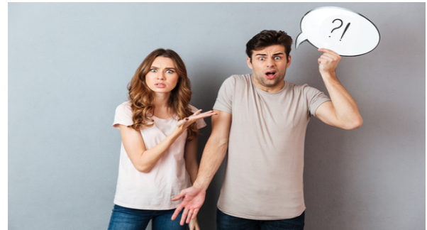
misunderstanding Causes / Effects