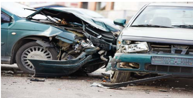
accidents Causes / Effects