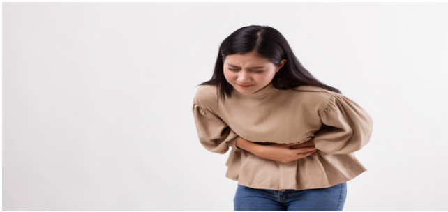
stomach ache Causes / Effects