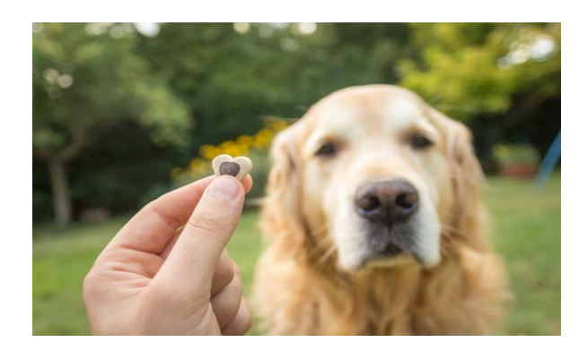
pets Opinion For/ Against