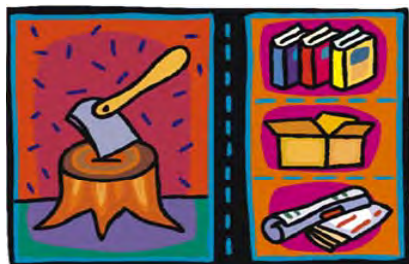
1 (cut down)

Use the pictures & your imagination to write sentences in the passive voice for each picture.