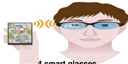
4 smart glasses