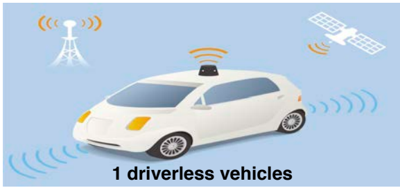
1 driverless vehicles

Complete the sentences with a positive & a negative about each issue.