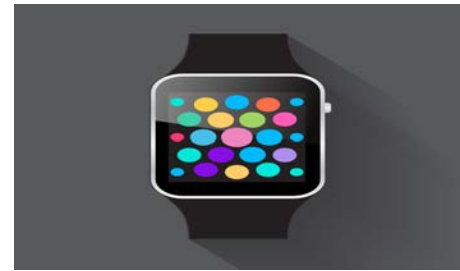
2 smart watches