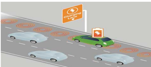
5 charging lanes for electric vehicles