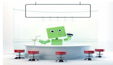
8 robot bartender