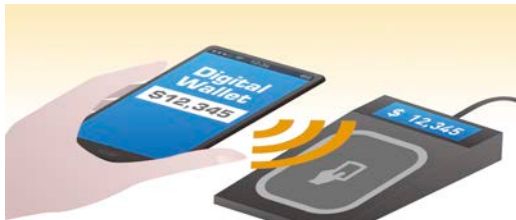
3 smartphone payments