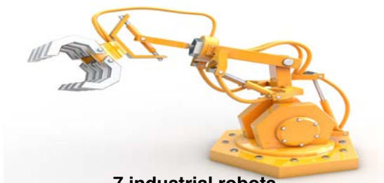
7 industrial robots