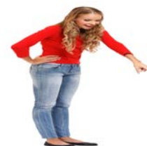
14. She is pointing _____ something.

Match the prepositions to the pictures and then complete the sentences with your own ideas.