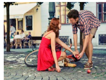
4 She fell _____ the bicycle.