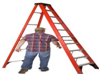
11 He is walking _____ the ladder.