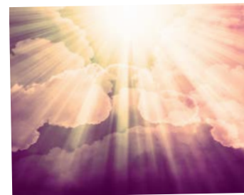
10 The sun is shining _____ the clouds.

through across "out of" along off into onto over past around