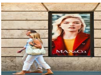
9 They walked _____ the advertisement.

through across "out of" along off into onto over past around