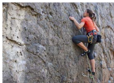
13 She is climbing _____ the cliff.