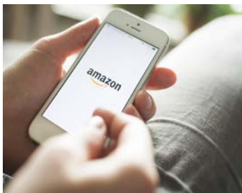
5 He is logging _____ Amazon.