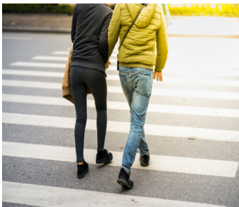
1 They are walking _____ the road.