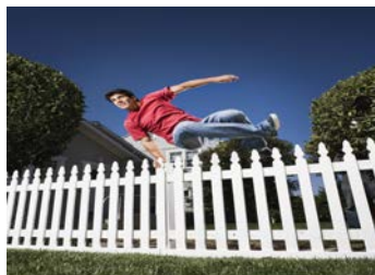
7 He is jumping _____ the fence.