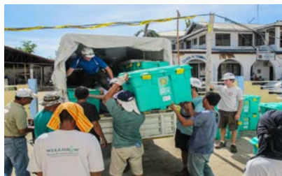
6 They are carrying boxes _____ the truck.