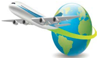
2 The plane is flying _____ the world.