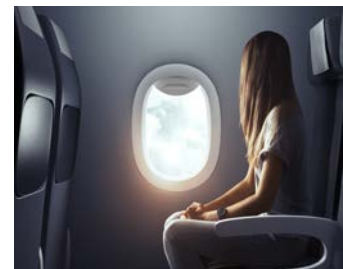
8 She is looking _____ the window.