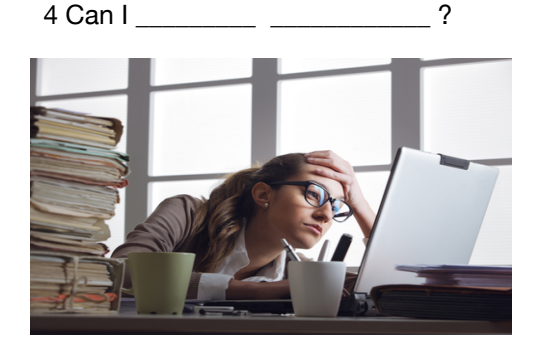
6 She .