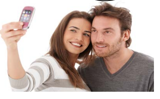
7 They are ______.