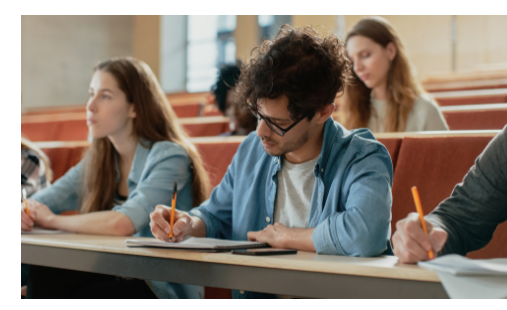
8 They are _____