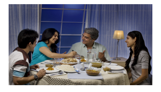
10 They always _____ together.