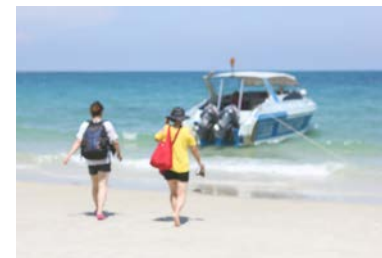
6 The tourists _____ a boat.