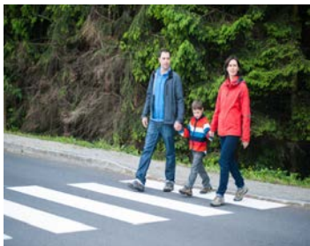
1 The family are _____ the road.