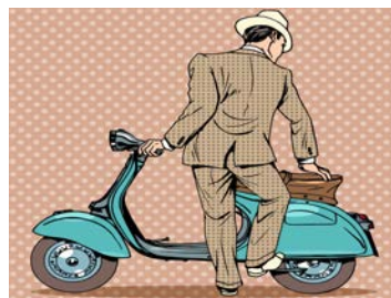
3 He is _____ a motorcycle.