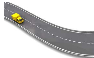
10. The truck is _____ the road.