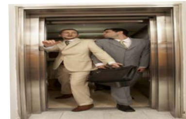
14. The business men are _____ a lift/elevator.