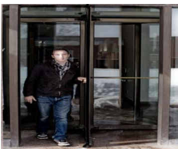
11 He is _____ of the building.