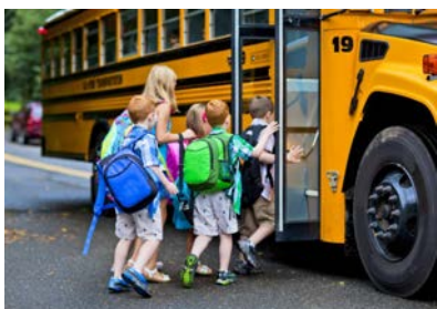
2 The students are _____ the bus.