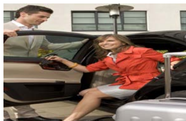
13 She is _____ of a car.