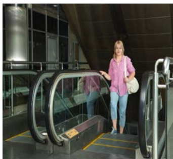
5 She is _____ the escalator.

Match the phrasal verbs to the pictures.