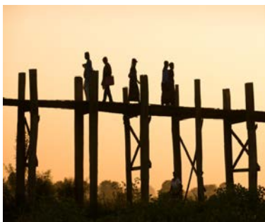
12 They are _____ a bridge.