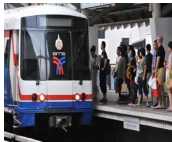
9 They are _____ the train.