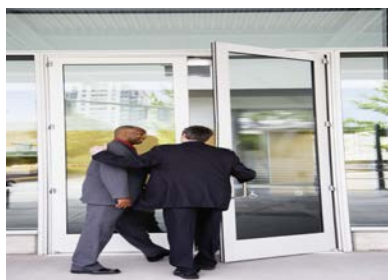
8 They are _____ a building.