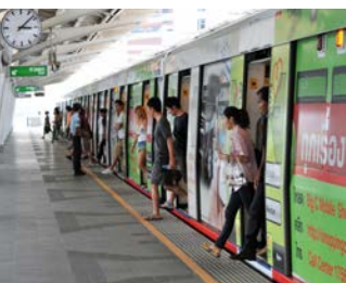
7 Passengers are _____ the train.