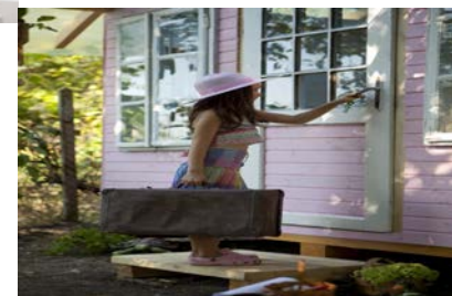
15 She is _____ the house.

Complete the following sentences with your own ideas.