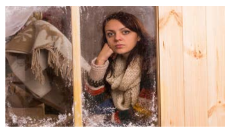
14 She is _____looking _____.