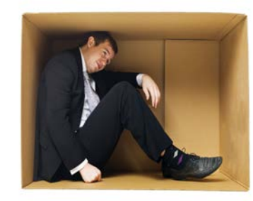
6 lt's a _ _ space. The man is_____ the box.