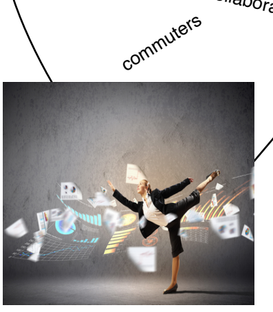
5 Your life is much more ______if you work at home.