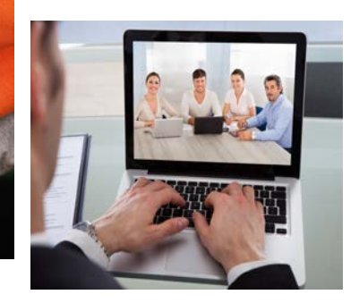
6 These days ______ is unexpectedly easy.