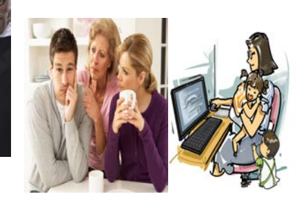
3 There might be many _____when working at home.