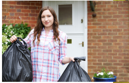
7 She _____ the trash _____ once a week.