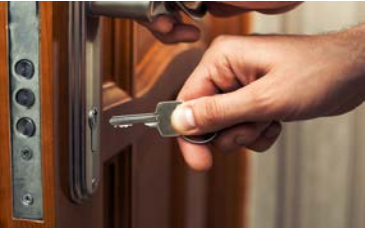
9 He _____ the key _____ the lock to open the door.