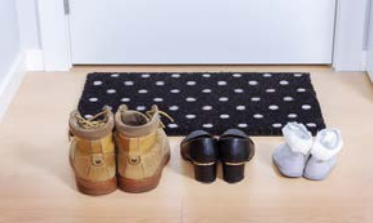
10 They _____ their shoes at the front door.