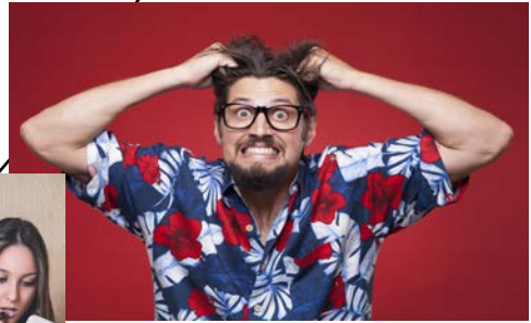
4 He _____ his hair _____ when he is angry.