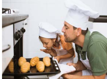
11 They are _____ the bread _____ of the oven.