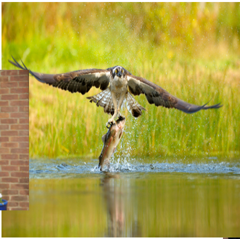
6 The bird is _____ the fish _____ of the water.