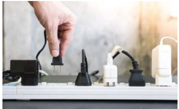
12 He is _____ a device so he can turn it on.