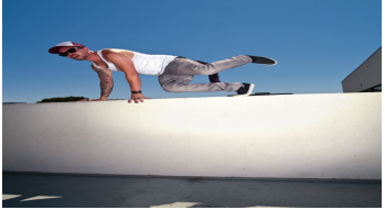
13 He is _____ a wall.