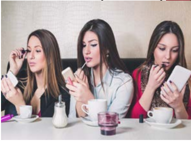
8 They are _____ make-up.