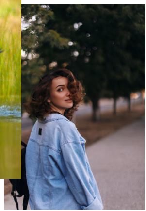
5 She _____ when I call her name.