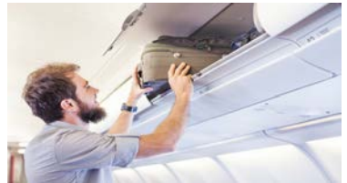
1 He _____ the bag _____ the overhead compartment.