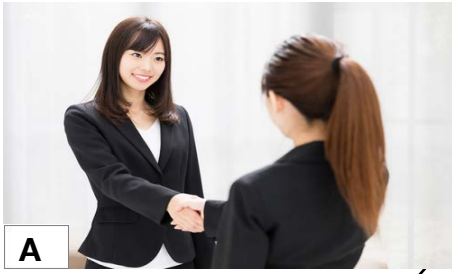
A 12 _____