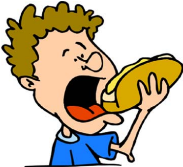
1 eats (verb)

city, eats, slowly, happy, beautiful, cold, buying, drives, quickly, hungry, house, books