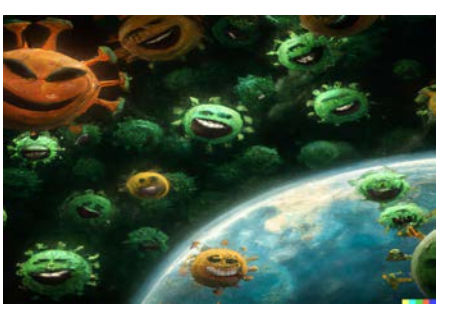
8 Viruses are the number one threat to the _____ of the world.