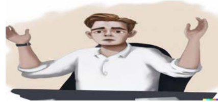
2 The working world is _____.