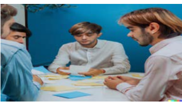
12 Interns need to _____ with people as part of a team.