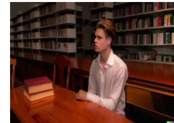
9 Students _____.

Match vocabulary above to the pictures. Then answer the questions below.