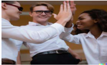
10 Interns have to learn to _____.