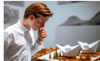
7 The intern has to _____ for an event.