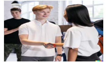
3 Company employees appreciate _____.