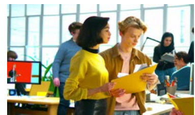
4 You should never be afraid to _____ and ask staff if they need assistance.