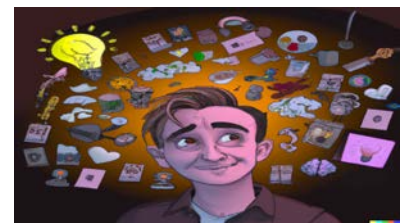
5 Interns also have to _____ and play a role in making decisions.