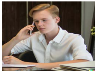
8 Then he has to _____.