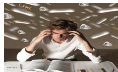
6 Being a student involves a lot of _____.