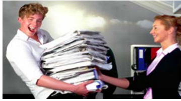
11 Interns should _____.