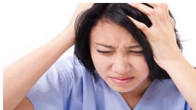
12 She is _____