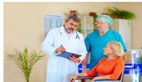
4 The _____ about her recovery.