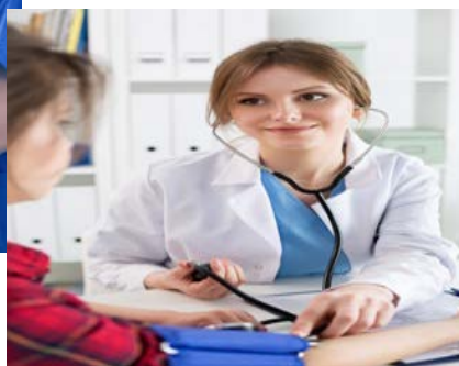
7 The doctor is _____