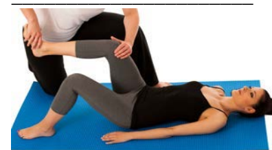
11 The therapist is trying to _____