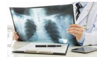
2 The doctor uses the x-ray to _____