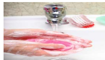
1 Washing your hands _____