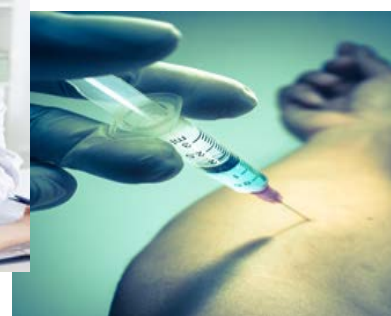
6 He is _____ into the patient's arm.