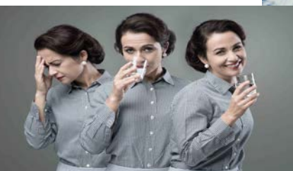
9 Taking medicine _____