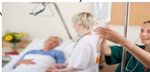
5 The nurse is _____