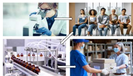
12. After testing, the next _____ is production.