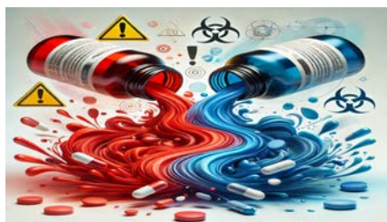
11. Drug _____ can be dangerous.