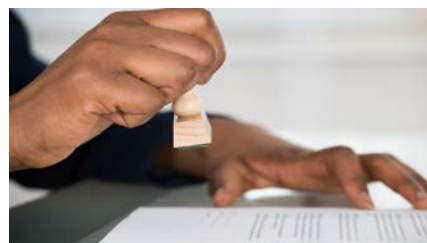
6. The FDA gave _____ today.