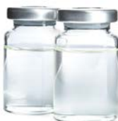
8. Check the correct _____.