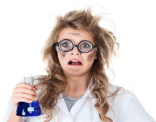
10. This is an _____ drug.