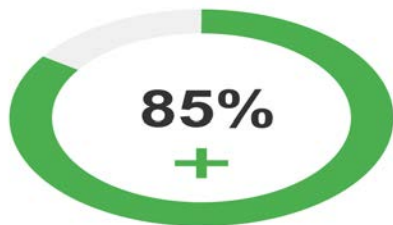
1. The _____ shows how well it works.

contamination | phase | therapeutic | breakthrough | dosage | side effects experimental | interaction | clinical trials | allergic distribution center | preventive | approval | expire | efficacy rate