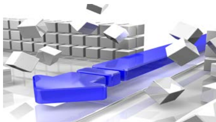
5. Scientists made a _____ discovery.