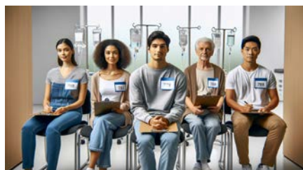
4. The drug is in _____.