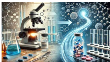
2. The _____ effects help patients recover.