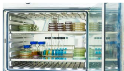
15. Avoid _____ in the lab.