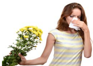
7. Some patients are _____ to it.