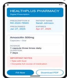
13. These pills _____ in April.