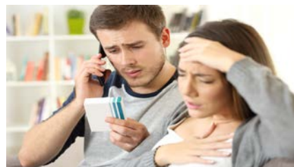
3. Watch for common _____.