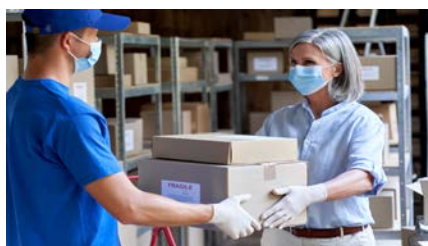
14. Shipped from the _____.