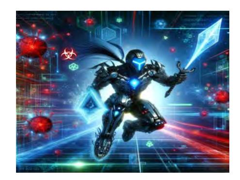
8. Ok Abeo. I just (15) _____ my new PC. What's next?.....Get a good (16) _____ program.