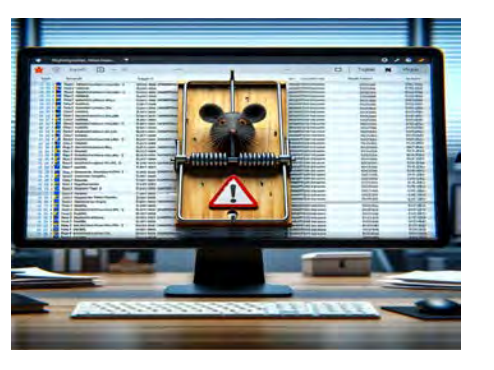
4. ...I got this weird (7)_____! Ooh....don't reply. That's (8)_____!