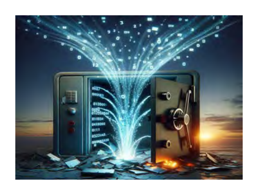
3. Ethan, our customer data got(5) _____ last night!...That's a massive (6)_____