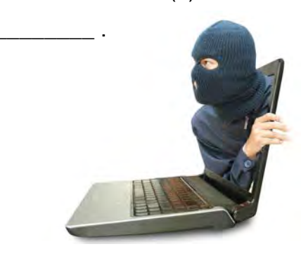
6. My work account's been (11)_____! Yikes! (12)_____ your passwords ..